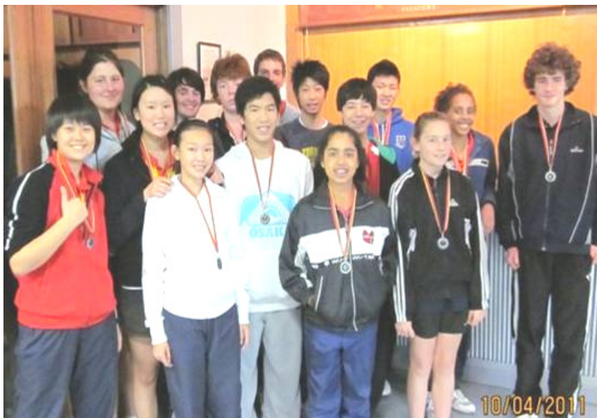
Pictured: The Under 15 and Under 19 Aged Title Winners